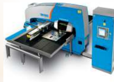
Servo Electric Turret Punch Press