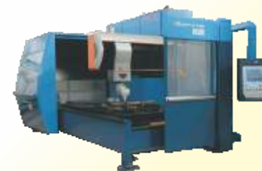
3D Laser Cutting