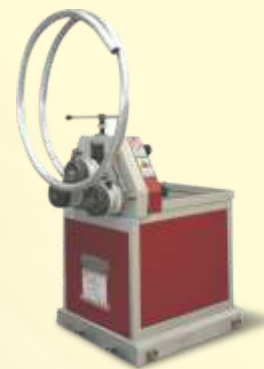
Profile Bending Machine