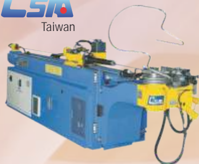
CNC Tube Bending Machine