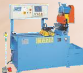
Tube/ Bar Cutting Machine