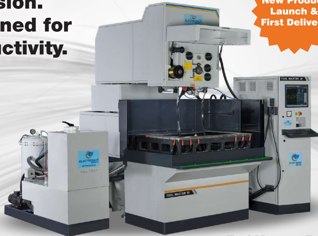
Tool Master 9F