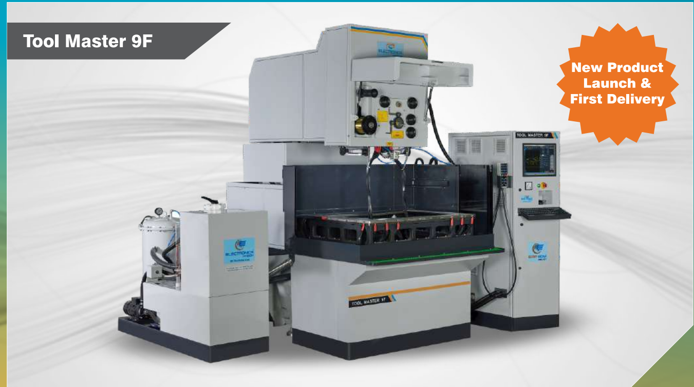
Tool Master 9F

Built to handle larger workpieces with ease, the Tool Master 9F helps manufacturers achieve greater efficiency while making the best use of valuable shop-floor space.