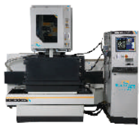
CNC Wire Cut EDM