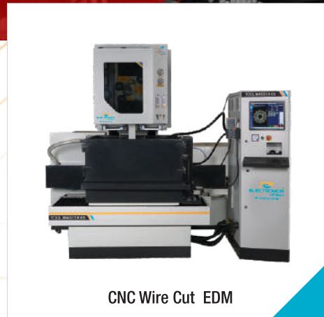
CNC Wire Cut EDM